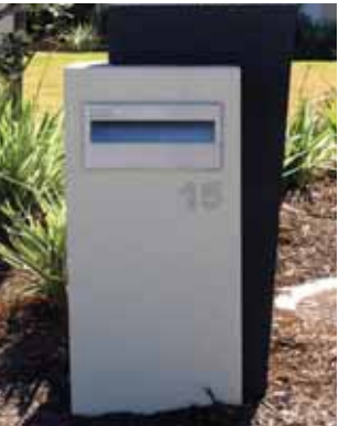
Examples of preferred letter boxes

The design and location of your letterbox must be provided with your landscape plan application. They must be DRC approved prior to installation.